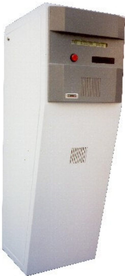
Model TD-6030 Ticket Dispenser