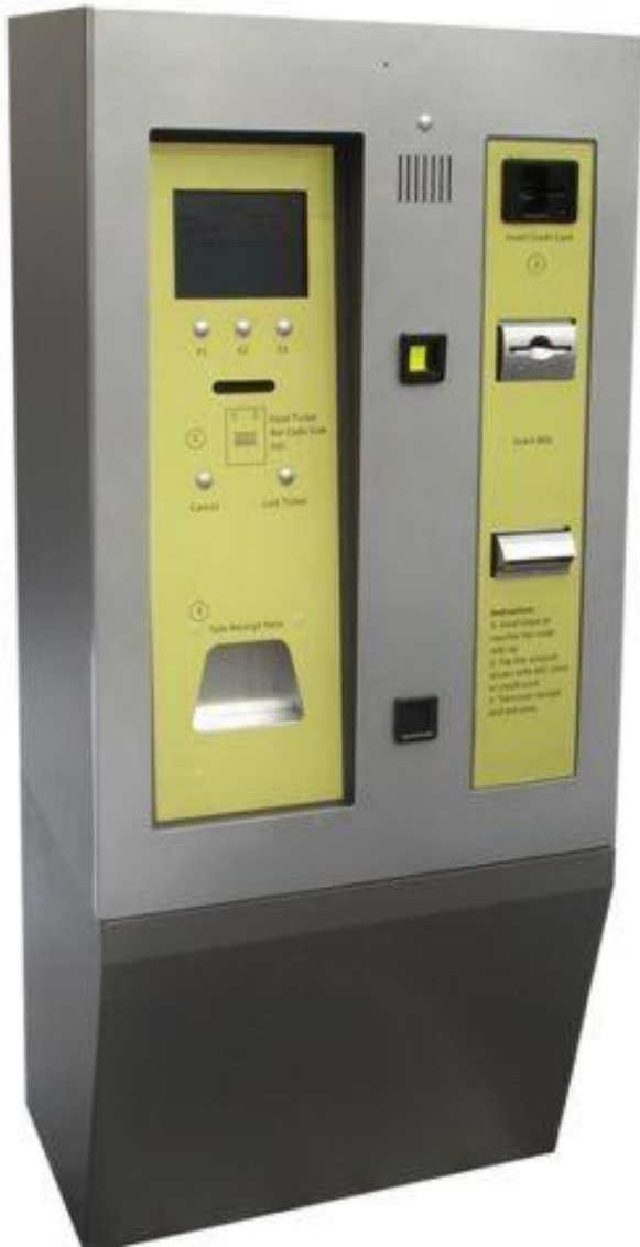
Model PS-2020 Remote Pay Station